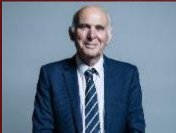
Sir Vince Cable Former Leader of the Liberal Democrats