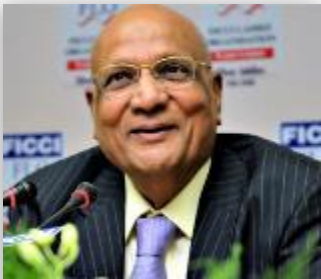
Lord Swraj Paul