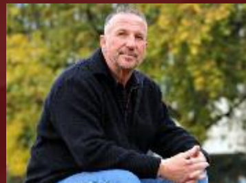
Sir Ian Botham Former England Cricket captain