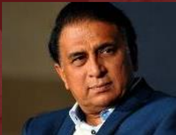
Sunil Gavaskar Former Indian Cricket captain