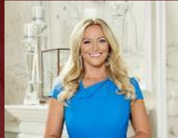
Baroness Michelle Mone OBE Co-founder, Ultimo