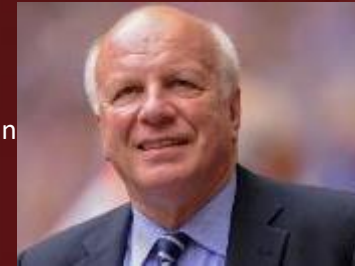
Greg Dyke Former Director General, BBC