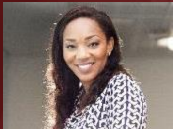
Bianca Miller BBC Apprentice star, Forbes 30 under